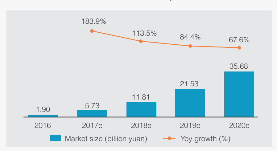
Exhibit 2: Short video market in China, 2016 – 2020